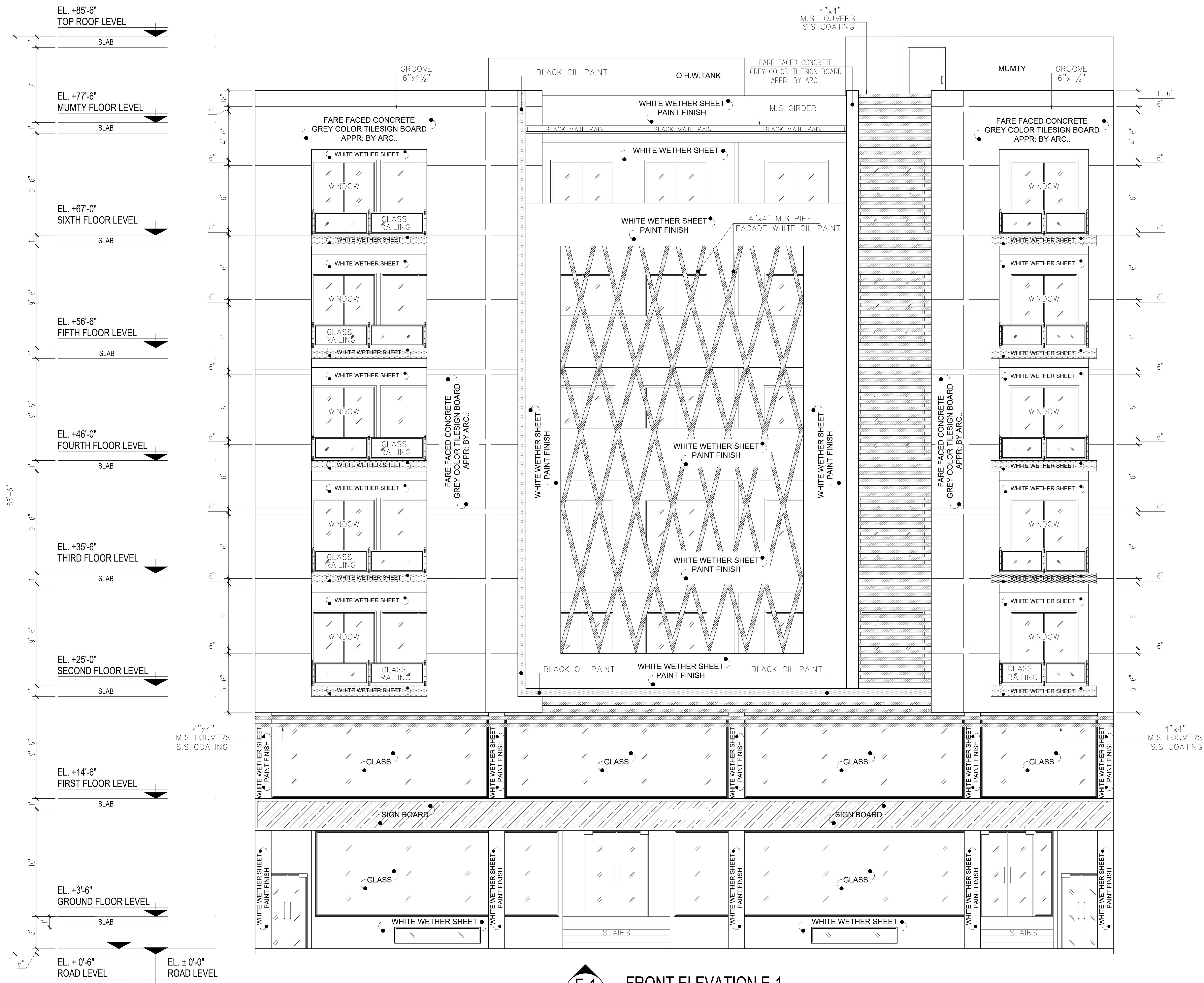
E-1 FRONT ELEVATION E-1